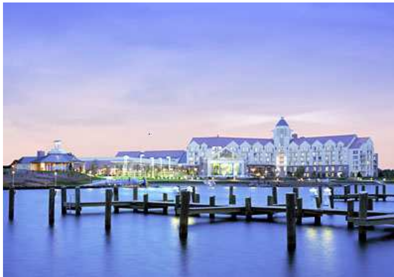
Hyatt Regency Chesapeake Bay Golf Resort Spa and Marina

Planning for the 2006 fall conference is well underway. If you didn't have the chance to attend last year's conference at the Cambridge Hyatt, you missed a wonderful training event. If you were there last year, you know you don't want to miss it this year!